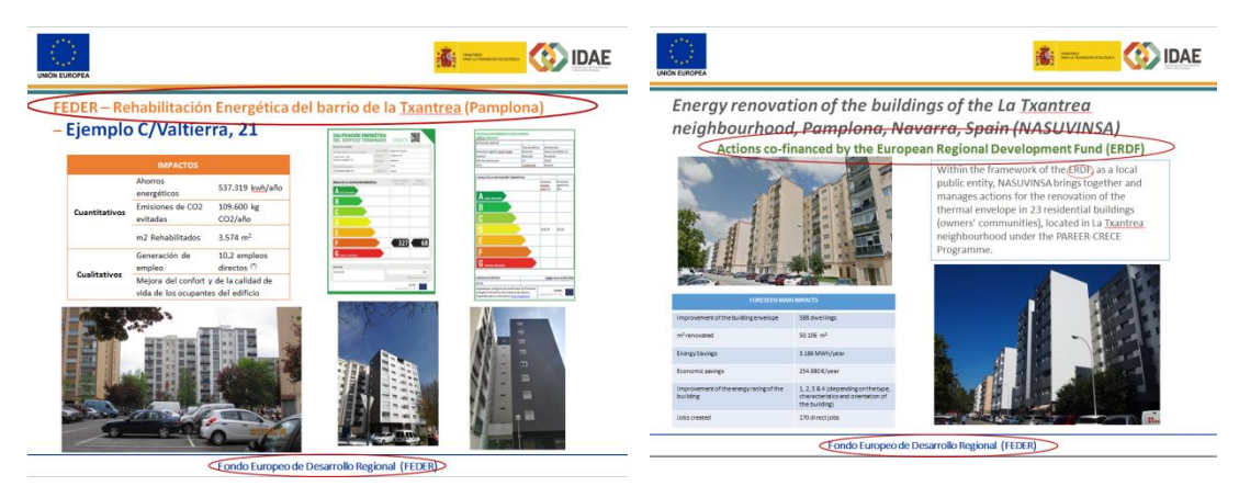
DOCUS-INFO IDAE-ERDF Series La Txantrea

Presentation of results at national and international forums. The IDAE takes part in multiple conferences/seminars organised by various entities, both public and private, in an effort to promote the aid schemes co-financed by the ERDF, as well as their results.