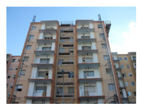
Energy efficiency improvement of building at No 5, Azoz Street

It is also interesting to note that thanks to this action, the professionalisation of the energy building renovation sector has been enhanced, leading to the development of ambitious energy savings plans that have resulted in the execution of high-quality projects that have upgraded aging and deteriorated buildings to meet the needs of the 21st century. Furthermore, the project improved the perception that residents have regarding the complexity of carrying out energy efficiency improvements in their homes, making the renovation processes more cost-effective, less bothersome to occupants and more environmentally friendly.