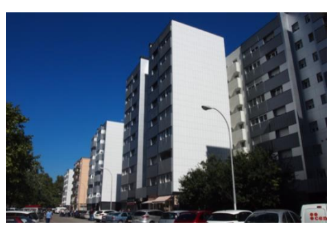
Azoz Street after the restoration