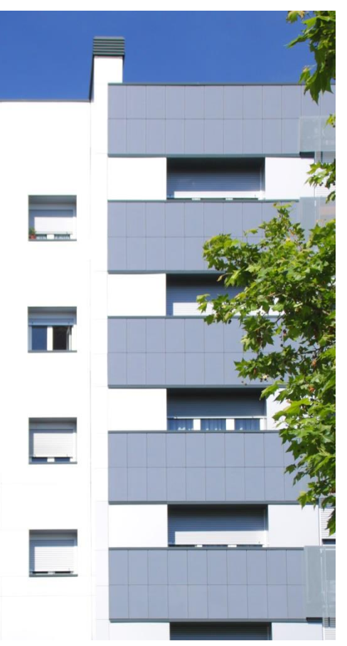
Refurbished building on Azoz Street

The IDAE, through its Programme for the Renovation of Existing Buildings (PAREER-CRECE), developed a series of grants to promote actions intended to make buildings in our country more energy efficient. The best practice presented is specific to social housing, which, within the framework of this programme, was eligible to receive additional grants if the