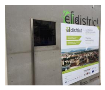
Efidistrict neighbourhood office

In addition, it should be noted that the local residents were guided throughout the process of their buildings renovation journey, as both the technical and social aspects were covered, to help them in every phase of the process. To this end, the Government of Navarre opened a "one stop shop office" (Efidistrict) in the neighbourhood in order to advise residents on possible technical solutions, process grants and help them with the provision of financing. This office remains open to this day, supporting new energy efficiency initiatives in the neighbourhood.