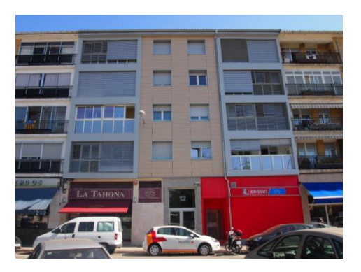
Different types of refurbished buildings in the neighbourhood of La Txantrea (Pamplona)

Finally, we must mention the replicability effect of this action, not only nationally, but in Europe and all over the world. Officials from the building renovation departments of Barcelona, San Sebastian, Vitoria and Zaragoza held meetings to compare and exchange related practices and strategies about this initiative, which has been taken as a reference in regional programmes of the European Union.