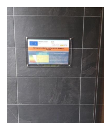
Building in Azoz street no. 5 with permanent plaque

Building in Urroz street no. 25 with permanent plaque