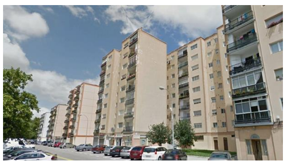
Azoz Street before the restoration

The holistic approach of this action, enable to solve key problems for the neighbourhood's residents, such as securing the financing required to carry out the works, as well as having the technical support needed to facilitate decision-making on matters related to improving the energy efficiency of their homes.