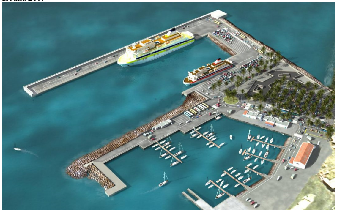
Infography: final outcome of the expansion of the Port of Playa Blanca, Lanzarote.

The port will also have a new Maritime Station, a commercial area of 2,300 m, as well as new esplanades in which new embarkation and parking areas will be located. The existing quay will be used for fishing, leisure and sports boats, increasing its current capacity from 162 berths to around 210.