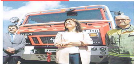
La conselleira Ángeles Vázquez participou no acto de entrega

Ángeles Vázquez destacó el compromiso de su departamento en la lucha contra los incendios y avanzó que, en breve, se entregarán nuevas motobombas a los concellos y al resto de distritos forestales. El objetivo, añadió, es dotar a todas las administraciones que colaboran en la prevención y lucha contra los incendios forestales de medios y material adecuado para el buen funcionamiento de los operativos.