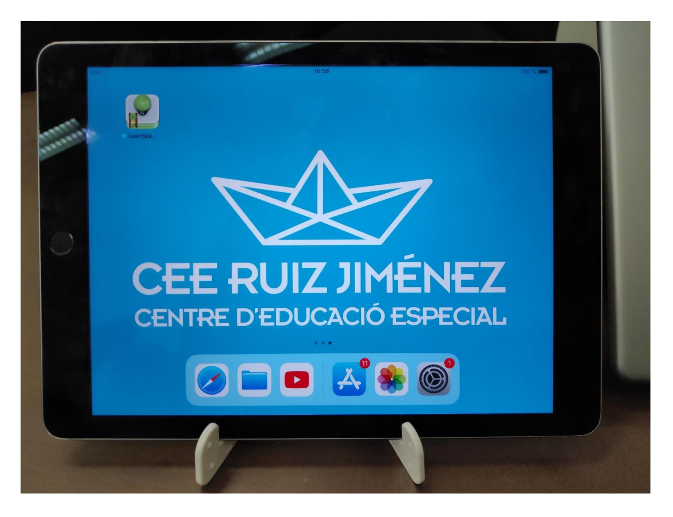
Adaptation of the results obtained to the established objectives:

The results obtained with the action taken is to integrate ICT in all existing spaces in an educational center of the Generalitat Valenciana. The Valencian model of Intelligent Center offers the necessary computer tools so that the use of ICT would be a reality in all the centers of the Valencian education system. To achieve this curricular integration, electronic devices are available to students, which are used as support, and even as an engine that allows innovative didactic methodologies.