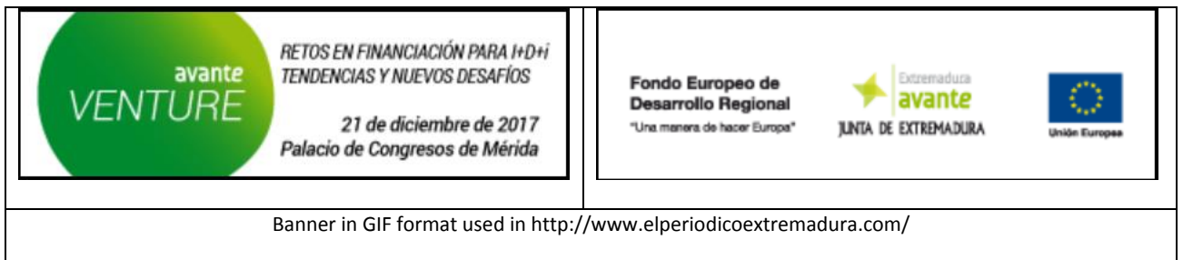
Banner in GIF format used in http://www.elperiodicoextremadura.com/