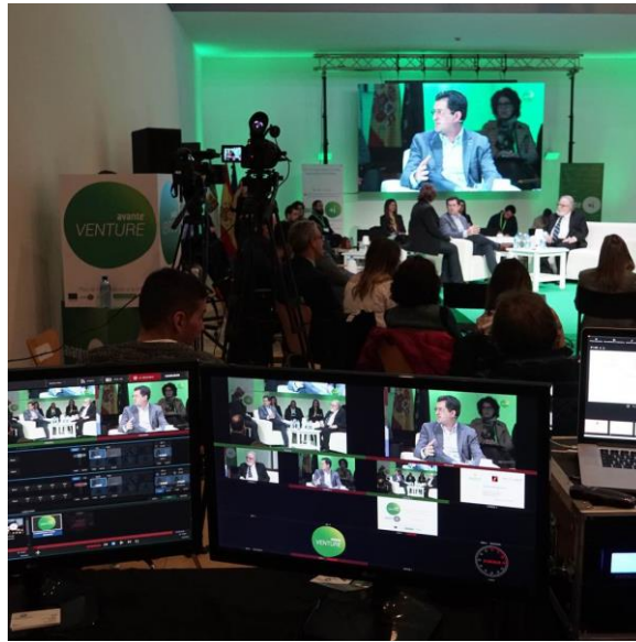
Streaming of the event

A high degree of coverage is provided in the meantime an extensive diffusion is made and, in addition to enabling the attendance in person to the act, a web is enabled to follow via streaming the same as, with the recording of Pills (video) and podcast (audio), it is allowed its Playback over the network at any point and at any time.