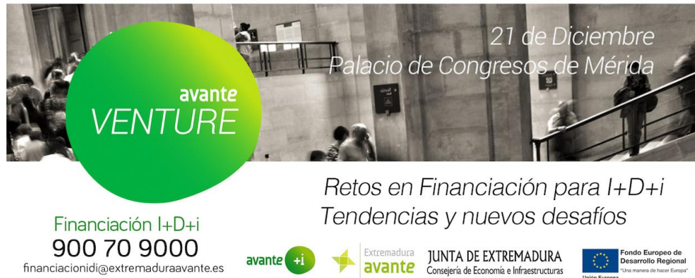
Published diffusion card of Avante Venture 2017

For the dissemination, Banner's hirings have been carried out in the main regional digital media, such as the newspaper HOY and the Extremadura Newspaper.