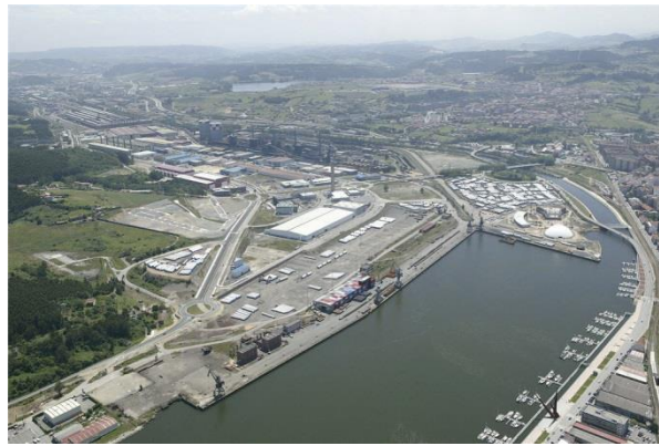
Aerial view of the Port of Avilés and the PEPA

The infrastructure carried out is of great strategic importance for regional industrial network communications. It will make the exit of goods easier, that will lead entrepreneurs to be one of the groups benefitting the most.