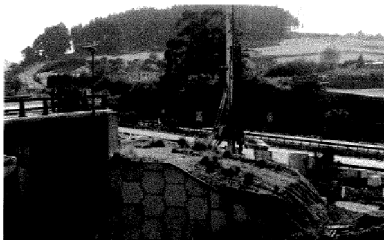
Obras de los accesos al PEPA.

La intervención obligará a realizar cortes de tráfico intermitentes hasta el próximo verano