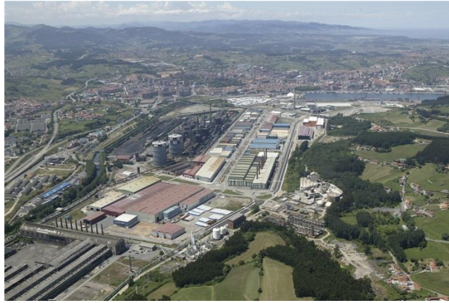
Aerial view of the PEPA

This action is considered to comply with good practices since it fulfils the following: